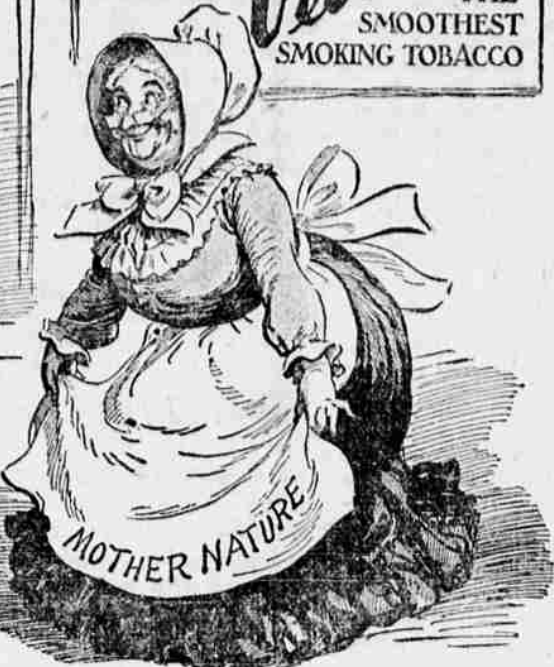
Partners: Father Time Ages VELVET. Mother Nature Mellows It.

MOTHER NATURE | FATHER TIME EXPERTS IN TOBACCO HEADQUARTERS FOR Velvet THE SMOOTHEST SMOKING TOBACCO