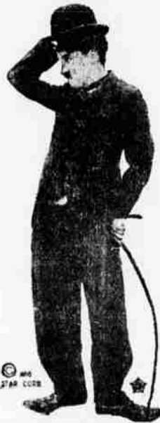
Charlie Chaplin in "The Rink."