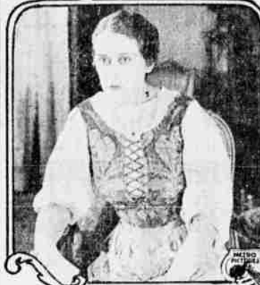
SCENE FROM "THE BLACK BUTTERFLY"

us analyze it and see if we cannot select a suitable title. Here is a woman who falls in love when she is an innocent girl. She goes to Paris with the man she loves, is jilted. A dark shadow passes over life, yet that shadow does not dim her brilliancy of mind, her beauty nor her strength of heart. She wins a place for herself in the world.