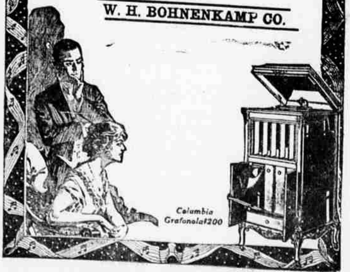
Columbia Grafonola 200