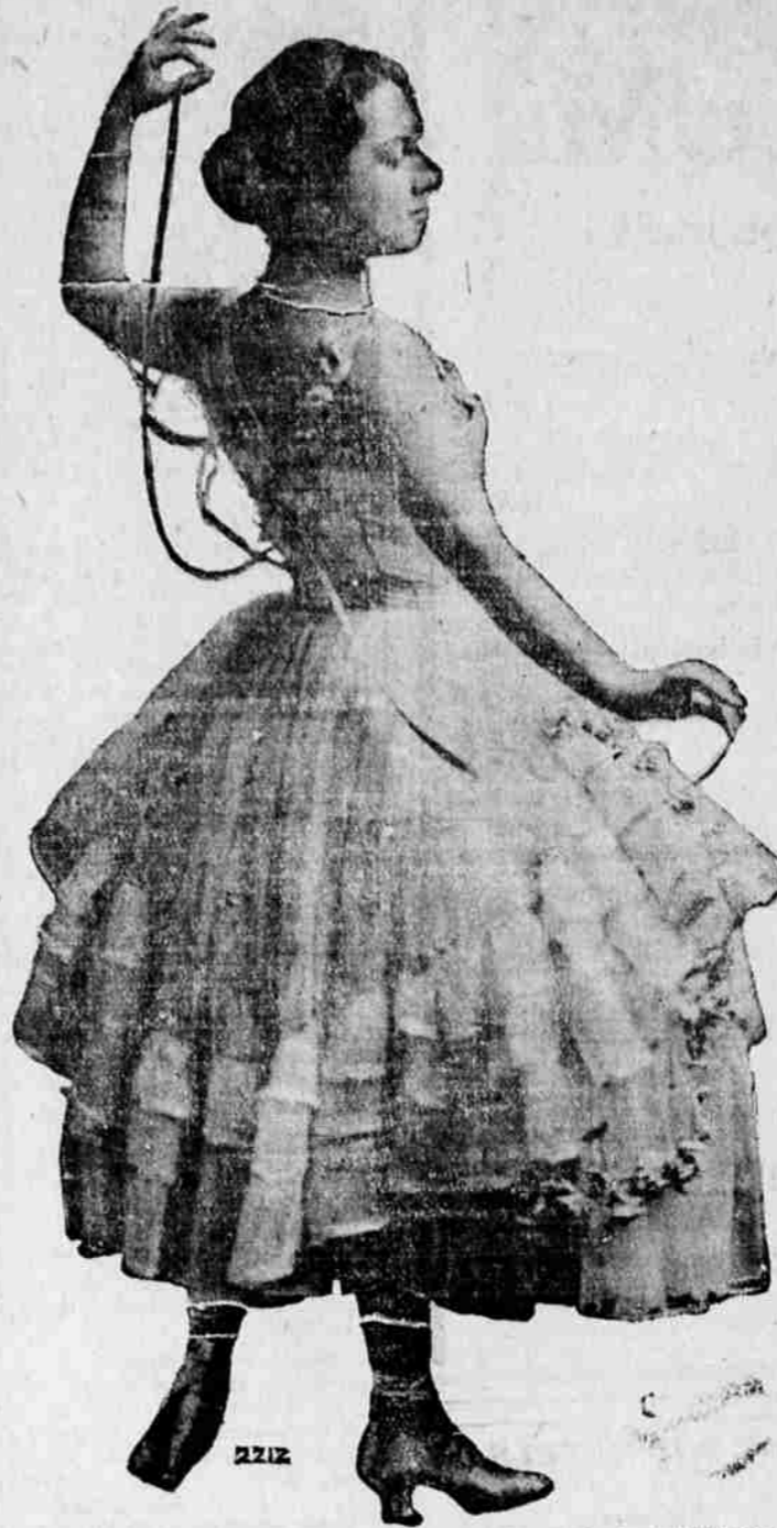
FLORENCE WALTON, FAMOUS PLAYERS STAR IN PARAMOUNT PICTURES.

This dress is of flesh colored tulle with ruffles of blue tulle edged in the same colored silk. Festoons of handmade roses in pale shades are draped around skirt and over one side of bodice. The underskirt is of sequin Bisson embroidery. The bodice is trimmed with the same embroidery.