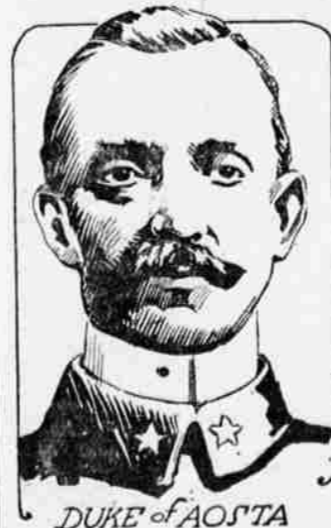
DUKE OF AOSTA

The people of Greece may be subject to the rule of an Italian, the Duke of Aosta who, it is reported, may be placed on the Greek throne by the allies, if they dethrone King Constantine. The Duke is a cousin of King Victor Emmanuel of Italy.