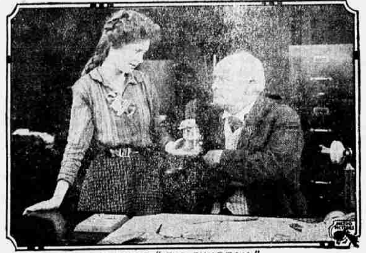
SCENE FROM "THE SUNBEAM"