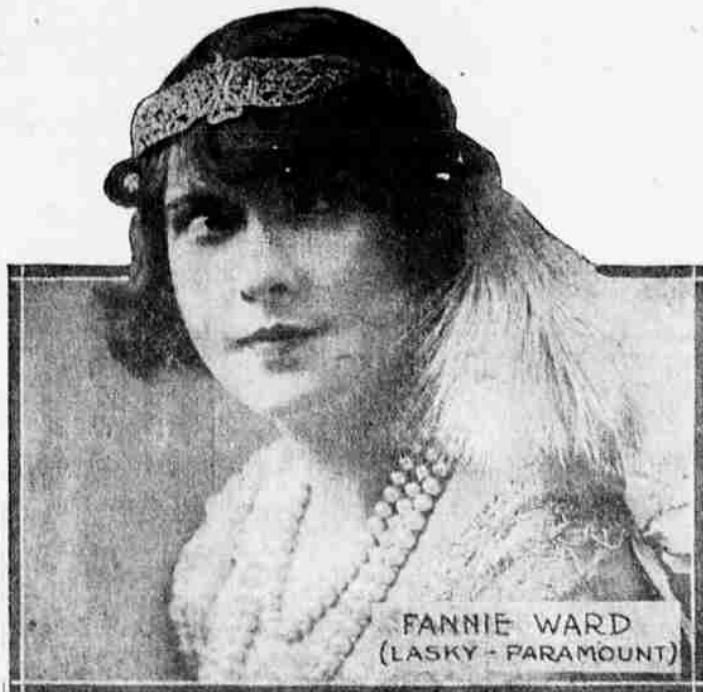
FANNIE WARD (LASKY-PARAMOUNT)