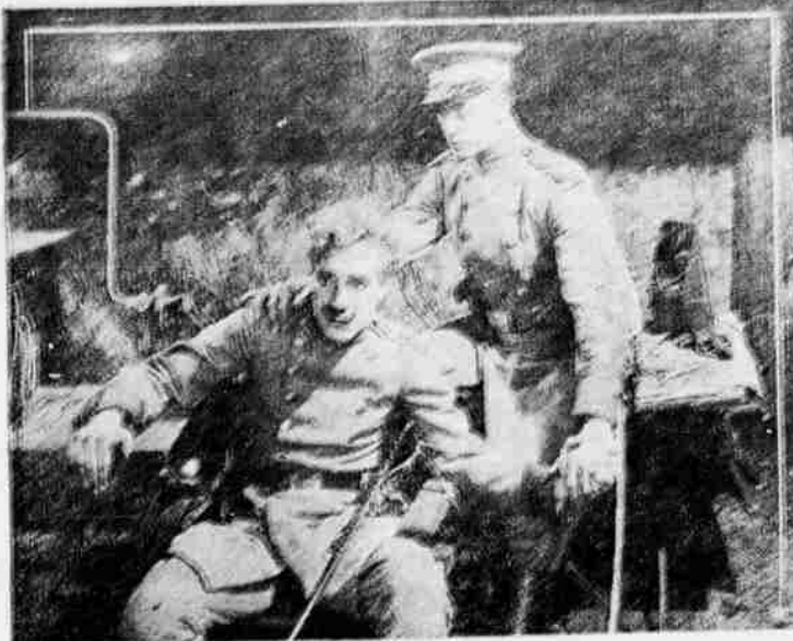
H. B. WARNER IN "SHELL 431" LATEST TRIANGLE PRODUCTION.