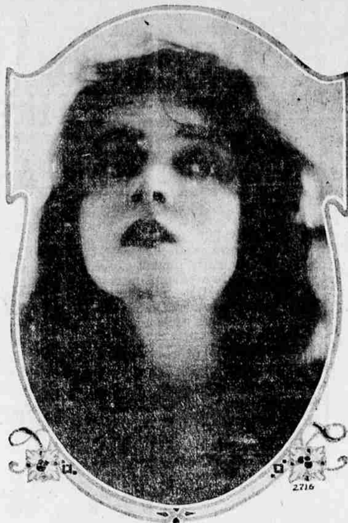
MARIE DORO, LASKY STAR IN PARAMOUNT PICTURES.

To have been the star on the stage and screen in a trio of successes within a period of less than five years is Marie Doro's unprecedented record. On the stage she starred in "The Morals of Marcus," "Diplomacy" and "Oliver Twist." And she has duplicated the performance on the screen in Paramount Pictures.