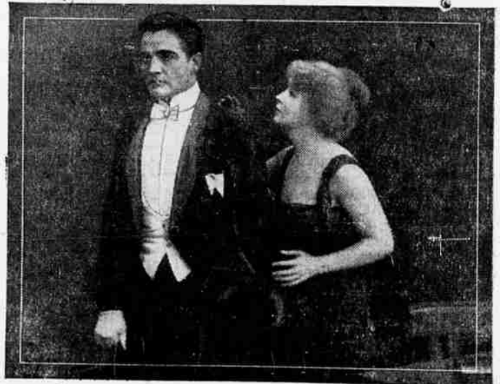
BESSIE BARRISCALE AND WILLIAM DESMOND IN TRIANGLE PLAY, "THE PAYMENT."