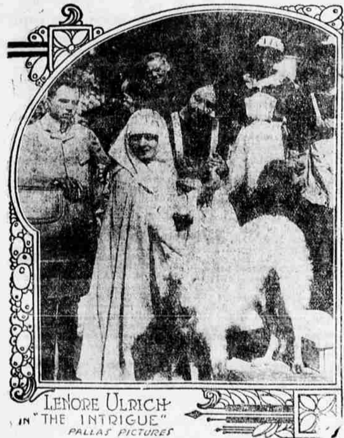
LENORE ULRICH IN "THE INTRIGUE" PALLAS PICTURES

Quality Service Honest Prices PHONE MAIN 43