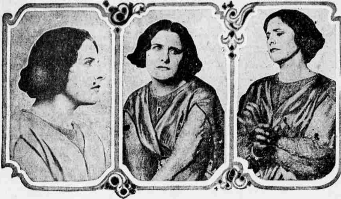
REMARKABLE PHOTOGRAPHS OF GERALDINE FARRAR AT THE MOMENT WHEN, AS JOAN OF ARC, SHE HEARS THE WORDS GIVEN THAT MEAN DEATH AT THE STAKE.

An eminent French psychologist and student of criminology is authority for the statement that the supreme test for the mind of man comes at the moment of realization of death. This conclusion was reached after years of study of murderers when the capital sentence was passed on them.