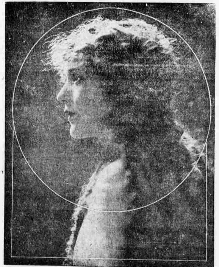
At Arcade Today and Tomorrow.

To Stop Wastage of Paper. The shortage of paper has for a long New York, Dec. 19.—(Special)—time been acute and has extended to