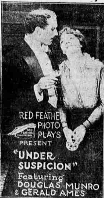
At Sherry's Today