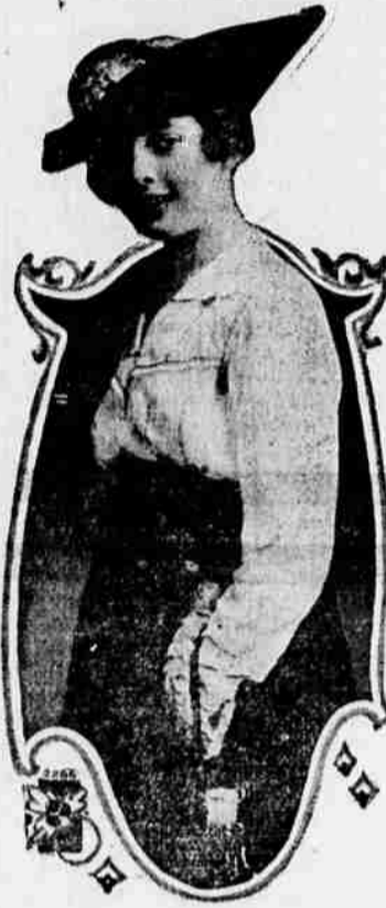
Marguerite Courtot, Famous Players Star in Paramount Pictures.

Because she is always smiling and always happy, Marguerite Courtot has come to be known around the studio as "Miss Happiness." It matters not what happens she always sees the bright side of things and is continually making others happy by the manner in which she does things.