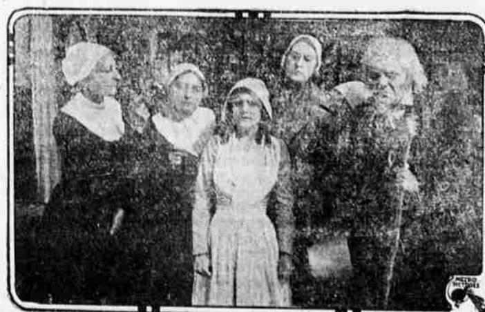
SCENE FROM "THE GATES OF EDEN"

roe. Some of the most amusing ruses which a crook ever employed are carried out by this extraordinarily sympathetic villain. He gets himself into the most tortuous complications, and then extricates himself again by