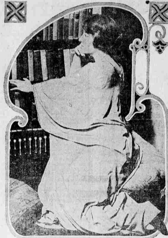
PAULINE FREDERICK, FAMOUS PLAYERS STAR, IN PARAMOUNT PICTURES.

Here's a bookworm that eats through volume after volume and, moreover, is enabled to digest it. No; the books are not harmed in the least, and Miss Frederick is the only bookworm that has ever been known to exist who does, by reason of her ravenous appetite for books, give millions of people pleasure. Much of her knowledge is gained by experience and much also through her books, which she dearly loves.