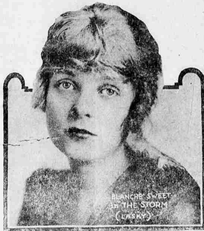
BLANCHE SWEET IN "THE STORM" (LASKY)