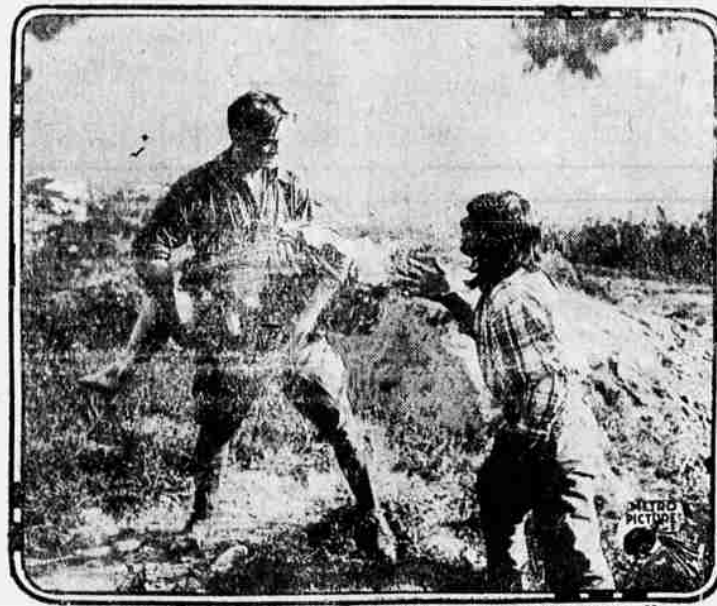
"SCENE FROM THE BRAND OF COWARDICE" At Sherry's Today