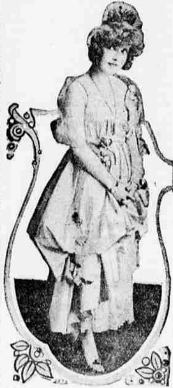
Fannie Ward, Lasky Star in Paramount Pictures.

There's nothing Fannie Ward loves more than clothes. Here's her latest evening gown, which she says she is going to save for her next Paramount Picture that is being produced by Lasky.