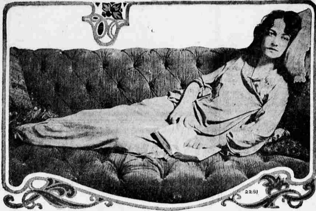
PAULINE FREDERICK, FAMOUS PLAYERS STAR IN PARAMOUNT PICTURES.

"I'd just love to be in motion pictures." That has been the cry and ambition of millions of people, believing in their hearts that it is the easiest position they could possibly aim for. But they are wrong. It's work, and hard work, from early in the morning until late at night. Work that so fatigues one that there is little wonderment that Pauline Frederick would appear to be exhausted after the day's toil. On this occasion she began long before seven o'clock and was in the studio until three o'clock the following morning.