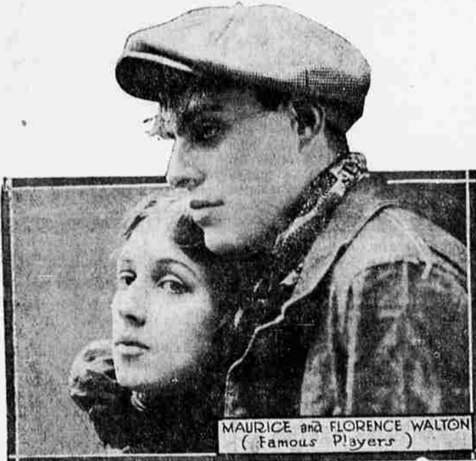
MAURICE and FLORENCE WALTON (Famous Players)

FAMOUS DANCERS, MAURICE AND FLORENCE WALTON.