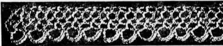
A MILE A MINUTE.

M ATERIALS: Crochet cotton No. 50 and a No. 5 steel crochet hook will make the edging a little more than half an inch wide. Commence with 11 chain.