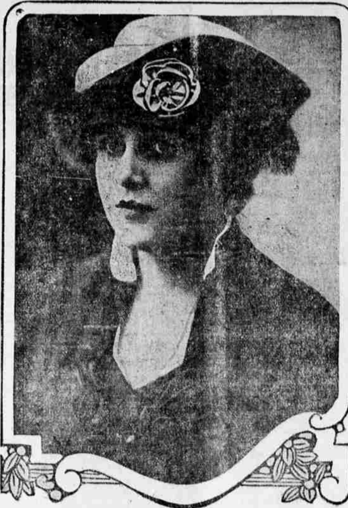
THE TRIMMEST ONE.

T URBANS are still the rage for street wear, and from the French capital comes this soft felt in light and dark gray trimmed with fox fur and a satin ribbon flower. The crown takes the lighter shade of gray. Paris rarely uses but one kind of trimming.