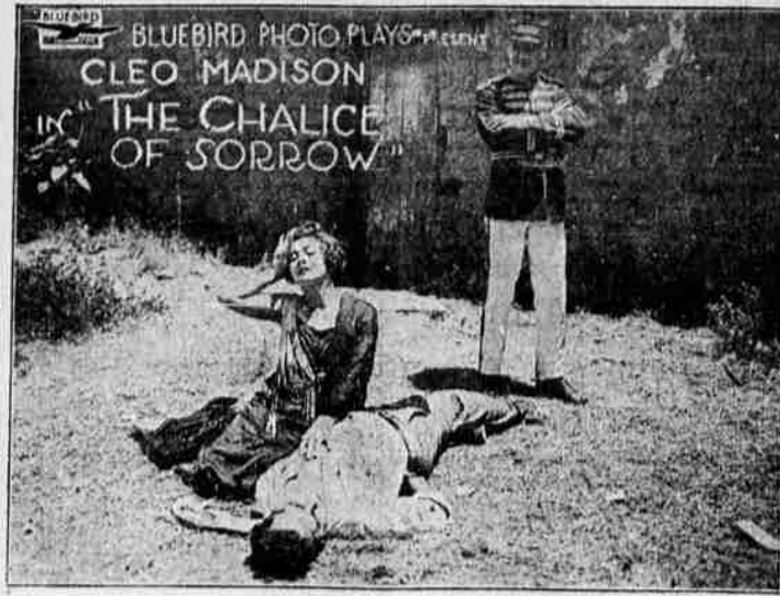
At Sherry's Today and Tomorrow