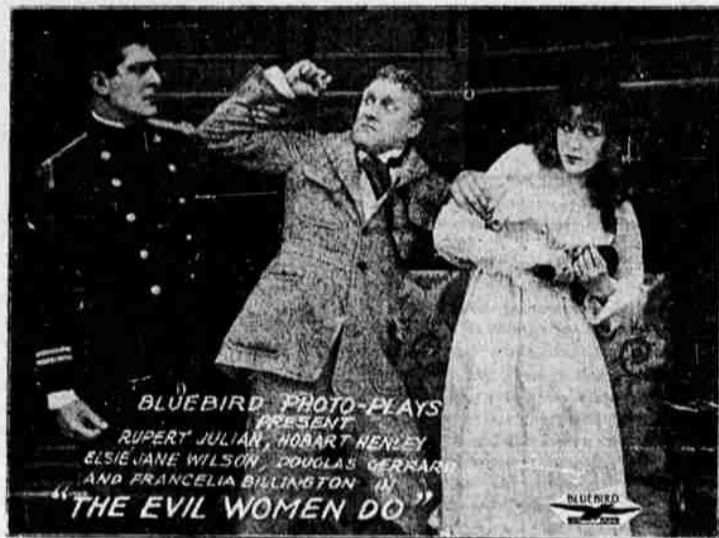
SCENE FROM "THE EVIL WOMEN DO."

At Sherry's because a well bred and beautiful girl objected to her father marrying, as his second wife, a Parisian adventuress, she paid dearly. The senile old Count Handry was obdurate, married the woman and in the end lost his fortune. That was not all, for the adventuress so demeaned herself, with others of her kind, that the foolish old man nearly made matters worse by taking his own life. Meanwhile his daughter, driven to desperation by the domination of the sinful wife, had left home and came close to being wrecked on the rocks of adversity. How all things were set right even to the visitation of retribution upon