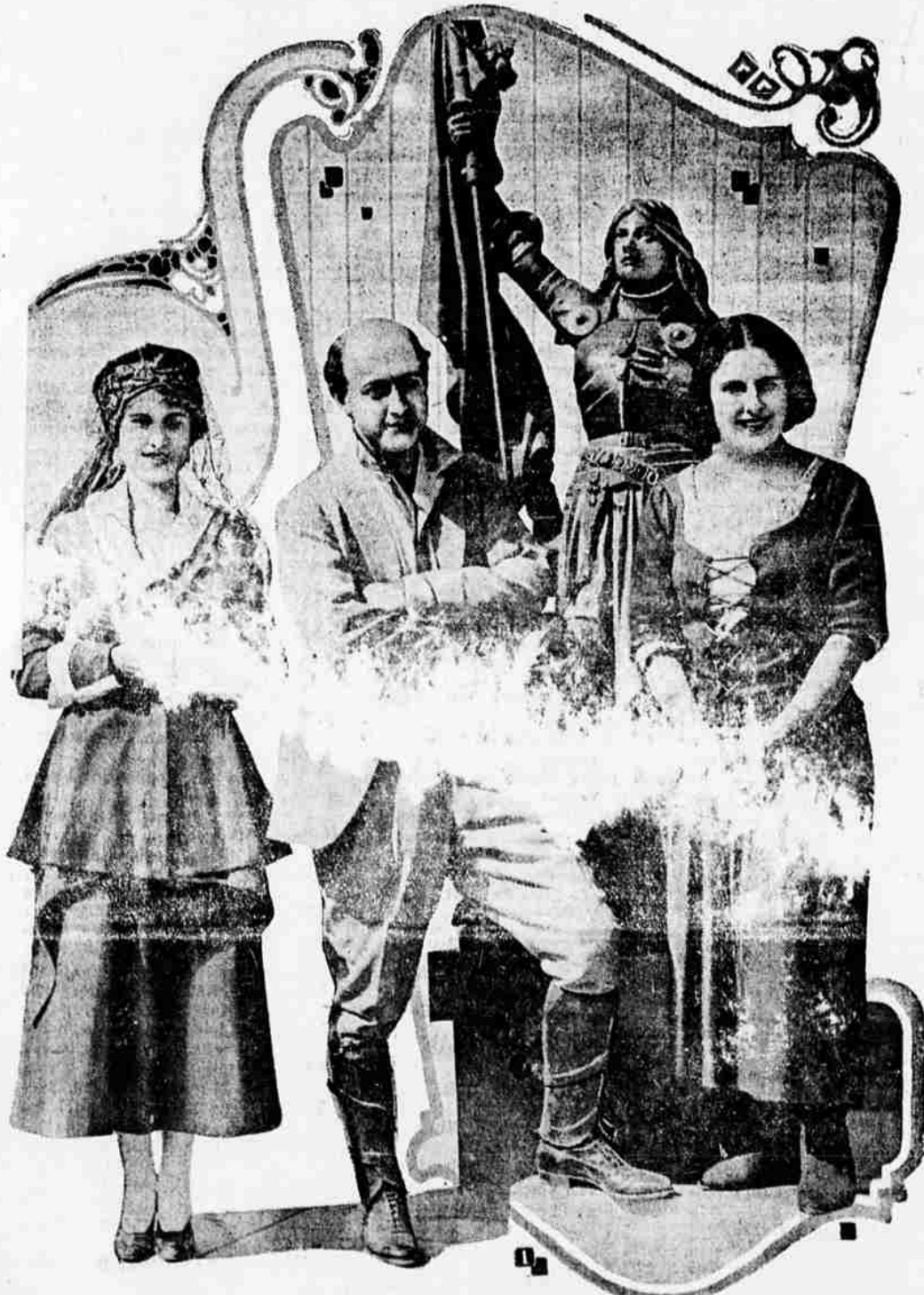
CECIL B. DE MILLE, FILM DIRECTOR, AND GERALDINE FARRAR PAY PRETTY TRIBUTE TO GREAT FRENCH WOMAN. Upon completion of the gigantic motion picture based on the story of Joan of Arc, Cecil B. DeMille, director of the twelve reel production, and Mme. Geraldine Farrar, American grand opera prima donna, made a pilgrimage to the famous statue of Joan in Los Angeles, and in the presence of 2,000 persons laid a huge wreath of laurel at the feet of the bronze image. Jeanie MacPherson, authoress, participated in the ceremonies. Mme. Farrar spent three months in the character of Joan during the making of the photoplay. She declared before leaving California she would show some special mark of tribute to the wonderful Joan. The exercises in connection with the placing of the laurel wreath at the statue were under the auspices of a committee of prominent Los Angeles residents of French descent.