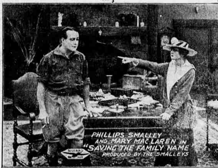
PHILLIPS SMALLEY AND MARY MACLAREN IN "SAVING THE FAMILY NAME" PRODUCED BY THE SMALLEYS

SCENE FROM PLAY AT SHERRY'S TODAY AND TOMORROW.