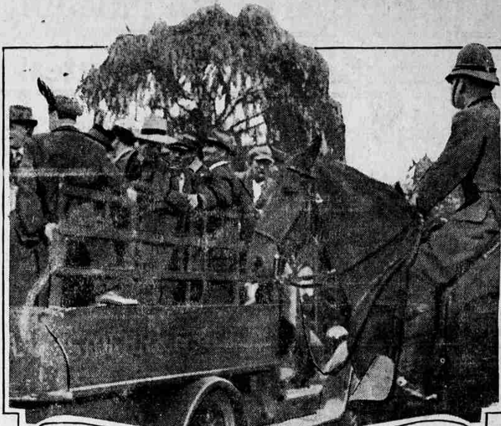
STRIKERS LOADED INTO WAGON AFTER BEING TRAPPED IN HALL AT OLD FORGE, PA.

Lackawanna-co prison at Scranton, Pa., is packed with 267 men, said to be Industrial Workers of the World, who declared a strike in the mining town of Old Forge, five miles south of Scranton. Labor day 3000 miners of Old Forge walked out in a sympathy strike with the miners of Minnesota. Not being able to secure a meeting place they are said to have taken forcible possession of a hall. State troops were called and arrested 267 of them. Bail was fixed at a total of $1,405,000, or an average of $5267 a prisoner. None was able to furnish bail so all are in jail waiting for the grand jury to make its report.