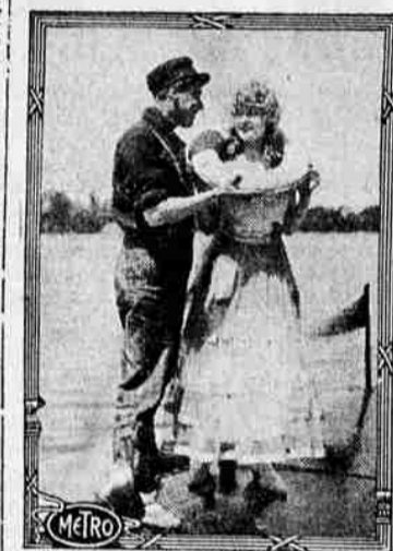
Scene from "THE RIVER OF ROMANCE"

Harold Lockwood and May Allison, without question one of the most popular stellar combinations now appearing on the screen, will be seen here at Sherry's today in "The River of Romance," a five-part Metro wonderplay, produced by the Yoko Film corporation, one of the Metro's newest producing companies. The scenes for this feature are laid around the Thousand islands, where Director