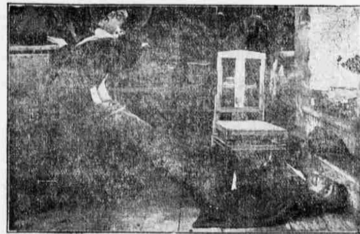
Scene from Remarkable Picture at Sherry's Today Only.

Did you see Cabiria? If you missed that masterpiece, you have certainly heard about it, and of course you know about the wonderful "giant" in that great film. His work was so unusual that he became the star of this greatest of all photoplays, even though the part was not originally considered a star part.