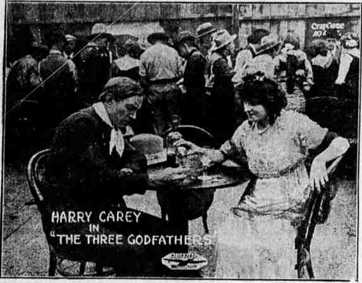
HARRY CAREY IN "THE THREE GODFATHERS"

When will the war end? Italian speculation gives the question many answers. The Vatican, it is felt, is making a stupendous effort to end the strife before Winter. The Pope, it is rumored, has not given up hope of accomplishing his purpose. The military apparently does not look for final triumph before 1918. The people guess everything, ranging from five more months to five more years. The Italian government, however, does not speculate. It leaves that to the others. In the meantime it prepares by hard and constant, but patriotic labor for an indefinite period of fighting.