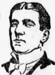
JAS. J. CORBETT Famous Prizefighter and Actor, says: "My enthusiasm for the fragrance and mildness of Tuxedo has no limit. Tuxedo is without doubt the most satisfactory pipe tobacco."

Once there were giants in the land, men who could scrap to beat the band. In modern times the cheapest skates are known as champeen heavyweights, but long ago, when Jim was young, men didn't fight with jaw or lung, but used their fists, and used them well—brave days of Jackson and John L. They slugged away, while they could stand, when there were giants in the land. And Corbett won his laurels then, among those mighty fighting men. He was the champion when that meant something more than getting fat, and standing, in a graceful pose, to figure in the movie shows. He's an authority on sport, and his decrees the wise ones court. He's an authority on smokes, and as his trusty pipe he stokes, he often says, "Tuxedo's best; it has the edge on all the rest."