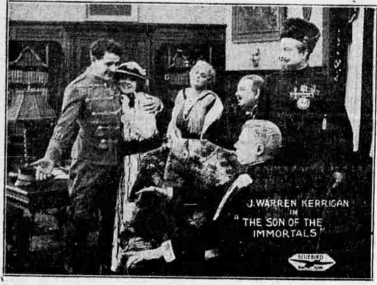
J. WARREN KERRIGAN IN "THE SON OF THE IMMORTALS"

New Phone Line in Forest. Troutlake, Wash., July 7.—A telephone line will be constructed in Co-