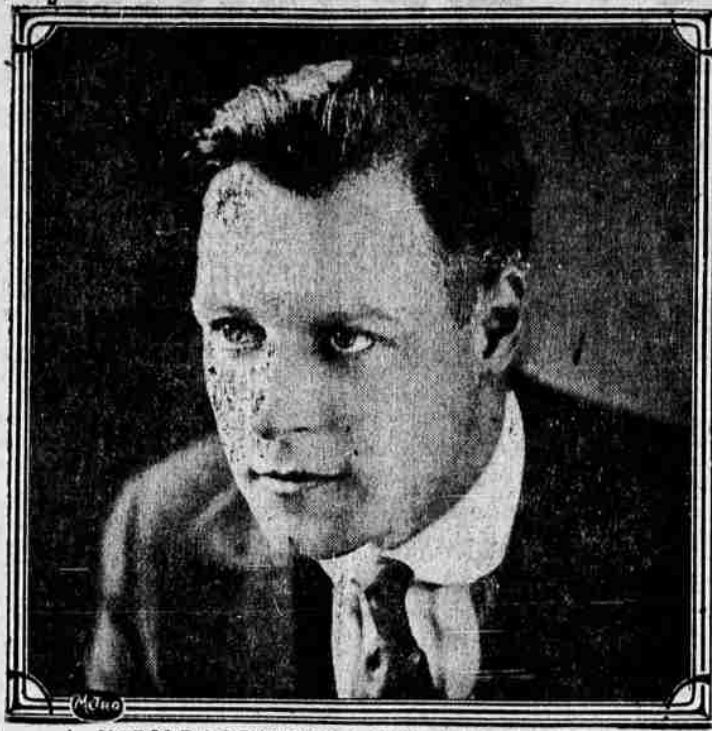
HAROLD LOCKWOOD in THE MASKED RIDER.

Viola Dana, tiniest of Metro stars, is a city girl for the first time in her life. She has had country air to breathe and country milk to drink all her girlhood, which may be one reason for her excellent health. She thinks the city is perfectly fascinating. "I love it," she says, "because there are so many moving picture theaters."