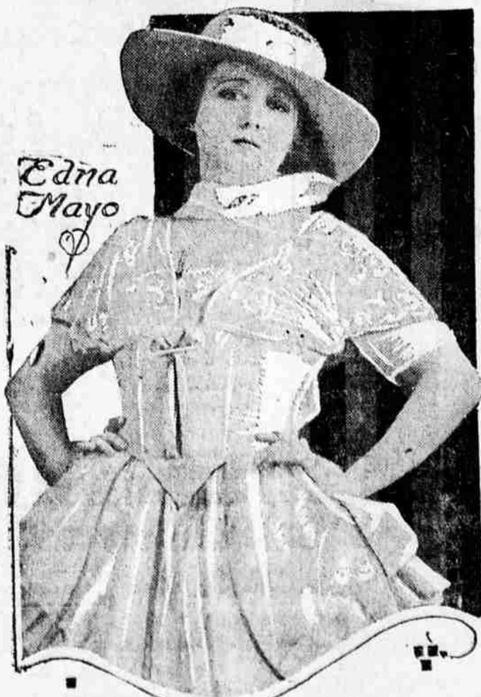
A gown built along the lines of the gowns worn in the olden days is the favorite of Edna Mayo, movie star. In this picture Miss Mayo is shown in a Lady Duff Gordon model with a bodice, which is of pale blue taffeta and shadow lace. A chartreuse green satin bow is fastened on the bodice with streamers. With it, Miss Mayo wears a new styled leghorn hat with pale blue satin streamers.