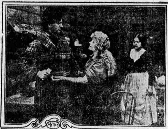
Scenes from "THE COME BACK."