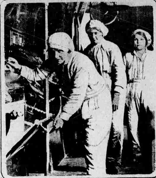
THE "JOLLY MILLERS" OF NOTTINGHAM, ENGLAND, ARE GIRLS NOWADAYS. AFTER MOST OF THE MEN OF THE TOWN JOINED THE ARMY SOMEONE HAD TO KEEP THE FLOUR MILLS GOING, SO THE GIRLS DONNED WHITE OVERALLS AND JUMPERS. SO FAR THE HOUSEWIVES OF NOTTINGHAM HAVE NOT COMPLAINED OF THE FLOUR MILLED BY THE GIRLS.