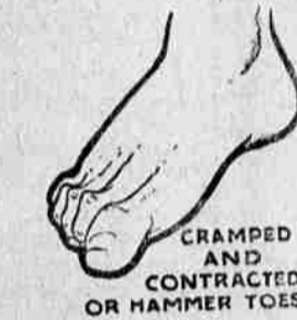
CRAMPED AND CONTRACTED OR HAMMER TOES