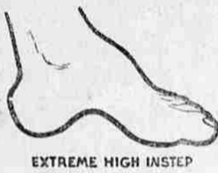
EXTREME HIGH INSTEP