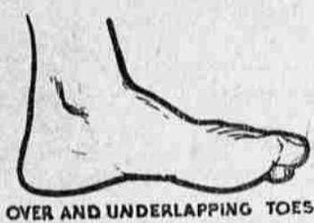
OVER AND UNDERLAPPING TOES

Scholl's Anterior Metatarsal Arch Support holds up transverse Arch—relieves callouses, Metatarsalgia and Morton's Toe. Absorb Callous Pads relieve pressure.