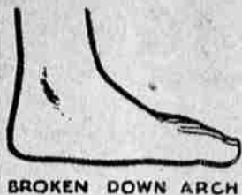
BROKEN DOWN ARCH