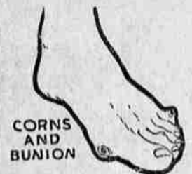
CORN AND BUNION