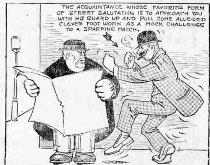
THE ACQUAINTANCE WHOSE FAVORITE FORM OF STREET SALUTATION IS TO APPROACH YOU WITH HIS GUARD UP AND PULL SOME ALLEGED CLEVER FOOT WORK AS A MOCK CHALLENGE TO A SPARRING MATCH.