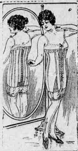
Stout Women Find La Camelle