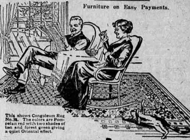
This shows Congoleum Rug No. 3. The colors are Pompeian red with two shades of tan and forest green giving a quiet Oriental effect.