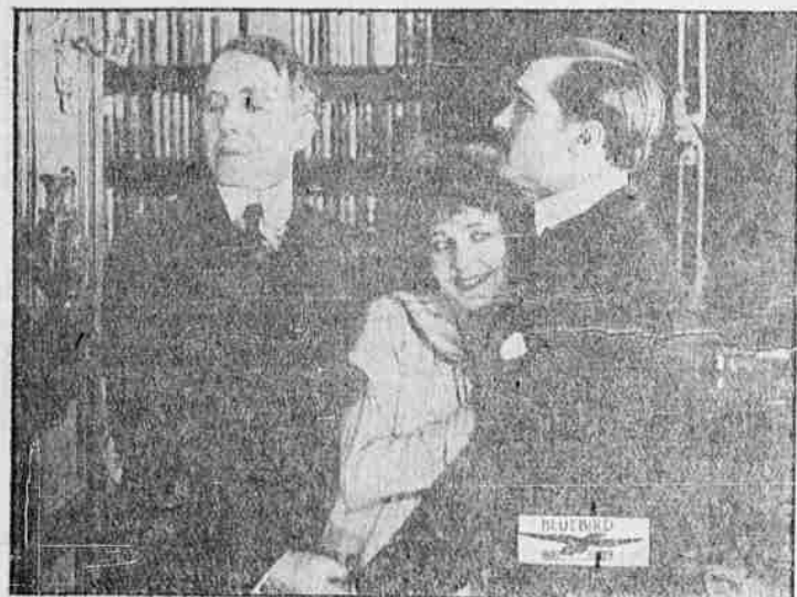
VIOLET MERSEREAU IN THE GREAT PROBLEM At Sherry's Today and Tomorrow.