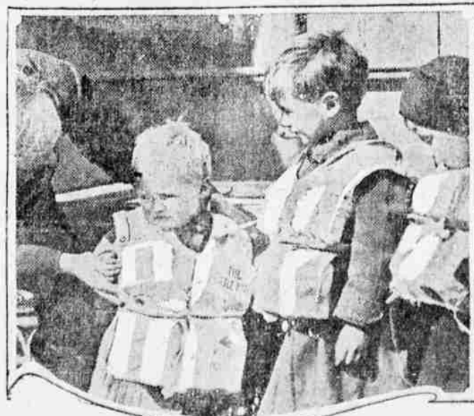
When an English steamer sails nowadays, every passenger, even to the tiniest kiddie, is required to participate in the life belt drill in anticipation of a submarine attack.