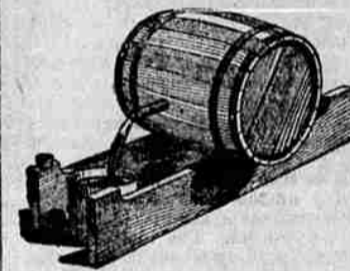
KEELS FOR PAINT KEGS.

In shops where a great deal of painting is done it is difficult to store the paint in such a manner that it will not thicken nor a skin form on the surface.