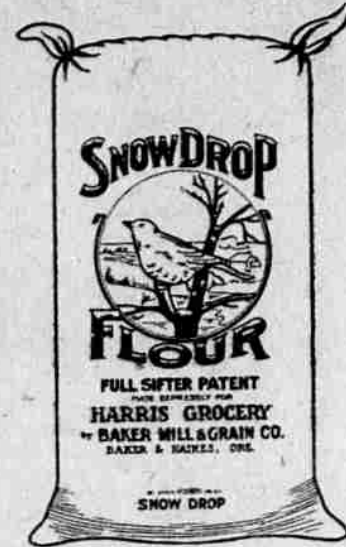
SNOWDRIFT FLOUR $1.50 A SACK

The flour that made La Grande Housewives Famous as Bread Makers.