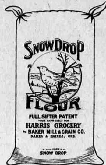
SNOWDRIFT FLOUR $1.50 A SACK

The flour that made La Grande Housewives Famous as Bread Makers.