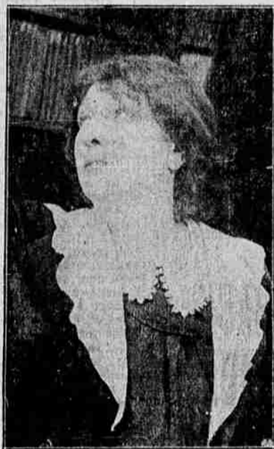
"DIVINE SARAH" WHO IS FEATURE OF FILM AT SHERRY'S