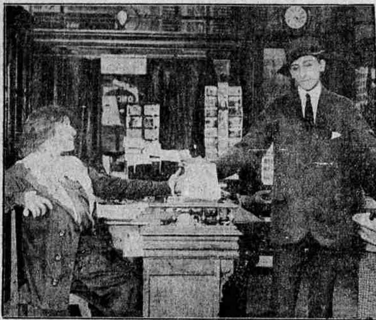
Scene from Bernhardt's Picture at Sherry's in which she is seen in feature acting despite physical infirmities.