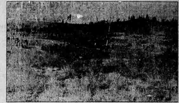
Photo of Palmer Land in Raw State Character of the Country, Stumps, Patches.

One-Tenth Down; One-Tenth Per Year; Interest 6 Per Cent