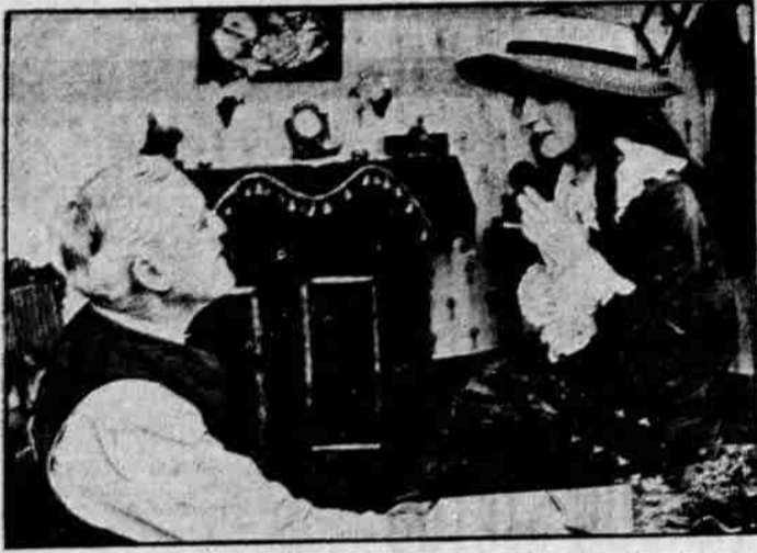
"The Wrong Door" at Sherry's