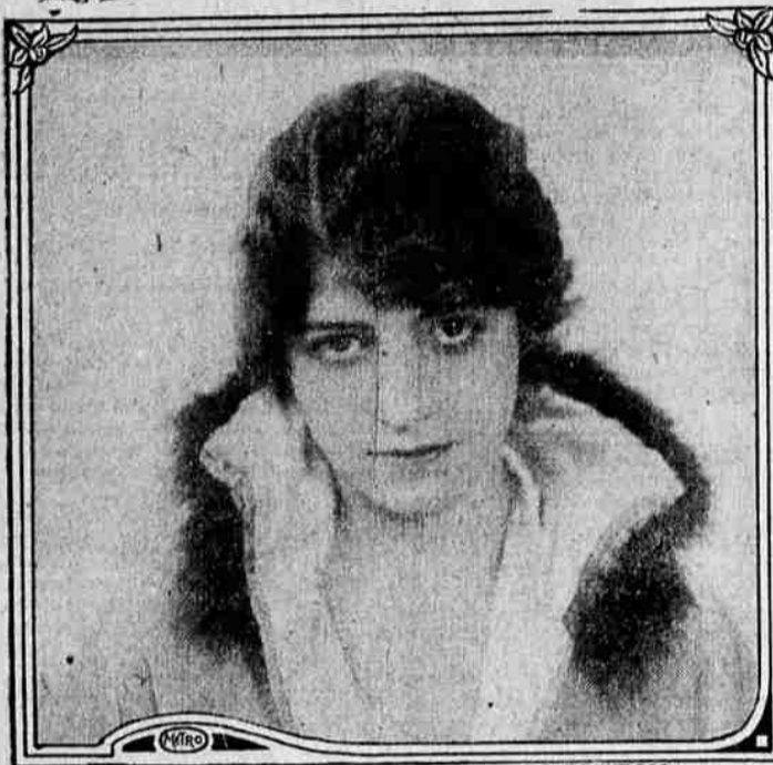
MARGUERITE SNOW IN "A CORNER IN COTTON"

Sherry's has secured for their Easter offering Marguerite Snow, the delightful young screen star, in "A Corner in Cotton," a five part Metro wonderplay. Miss Snow will be surrounded by an all star cast which includes Frank Bacon, the foremost character actor of the stage and screen. The production abounds with a wealth of interesting scenes, contrasting life in New York society with conditions among the poor in the slums there and with those that exist among the cotton mill workers in the south. It is one of those distinctive Metro features which sends the spectator away thinking long after seeing the production.