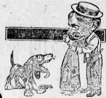
IT'S A DOG-GONE SHAME

PHONE MAIN 70 FARMERS PHONE B 192 408 North Fir Street, Cross Track