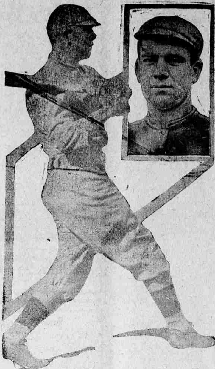
Two Views of This Speaker

This Speaker, the star outfielder of the Boston Red Sox, has been sold to the Cleveland American League team for a sum said to exceed $50,000. The deal involved the biggest cash consideration ever paid for a baseball player.