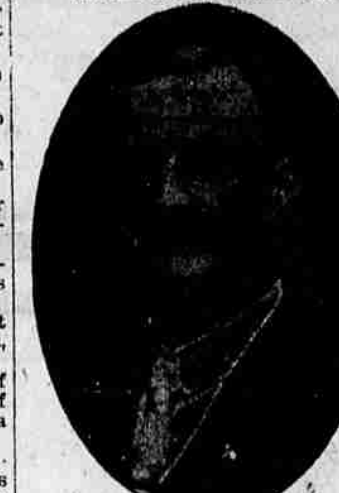
Present Joint Senator From Union and Wallawa Counties Who Today Announces His Candidacy for re-nomination.