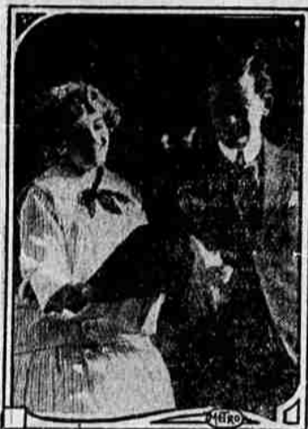
SCENE FROM "DIMPLES"