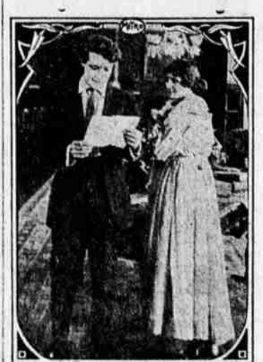
SCENE FROM "THE TURMOIL"