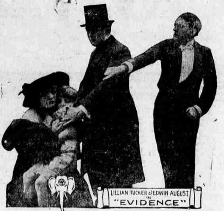
EVIDENCE. English "Society" Life in Motion Pictures.

SCENE FROM THE 5-PART SHUBERT FEATURE AT THE ARCADE SUNDAY