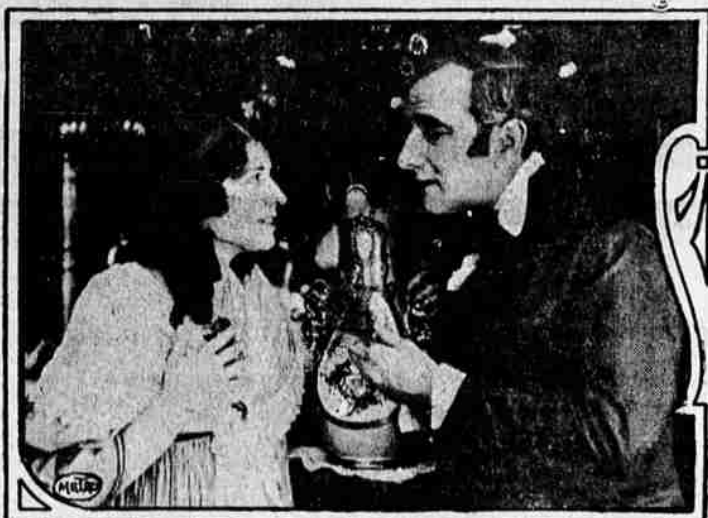
SCENE FROM ROSEMARY