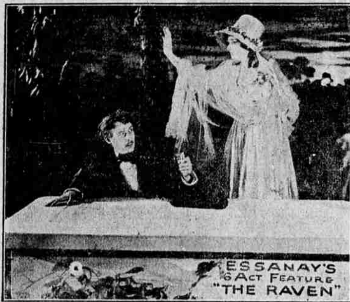
ESSANAY'S SACT FEATURE "THE RAVEN"