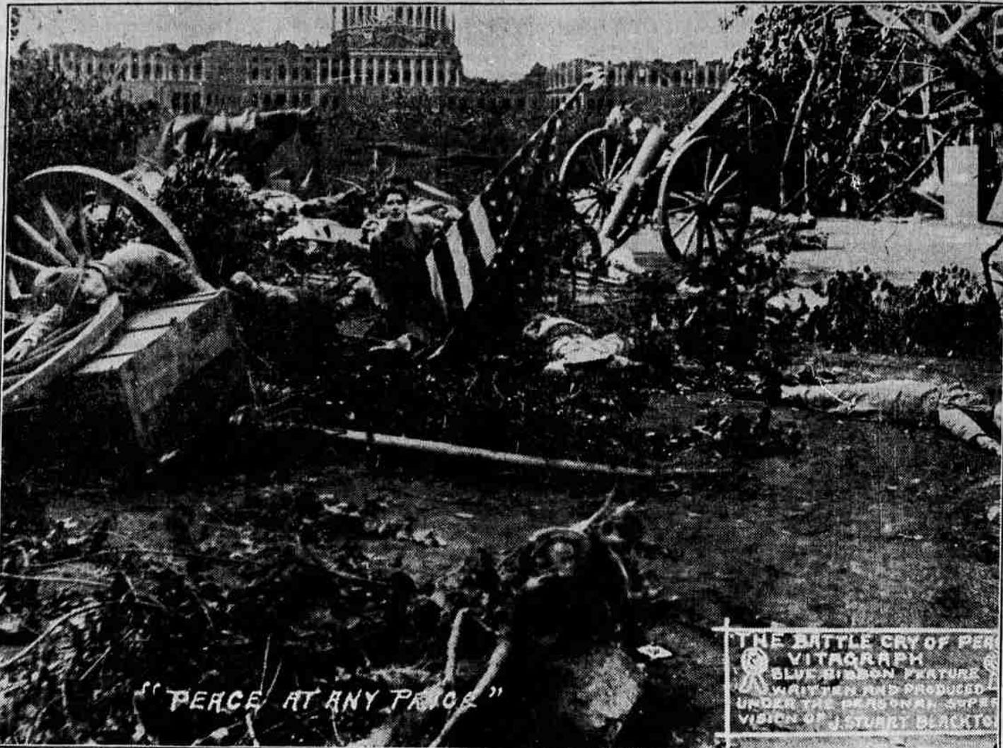
"PEACE AT ANY PRICE"

The cost of the survey is to be borne by voluntary contributions. It is expected that wealthy sportsmen who favor the game will contribute liberally to the expenses of the organization and a big fund probably will be realized.